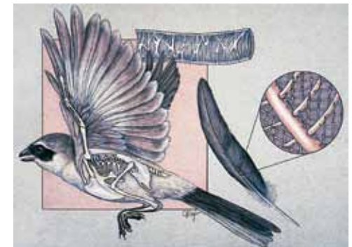
Bird Skeletal and Feather Anatomy, ©Laurie O'Keefe; colored pencil

Both the conference and workshops are available at discounted rates to GNSI members.