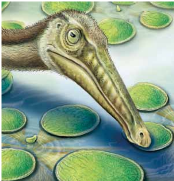
Fossil Reconstruction: Cobbania corrugata and ornithomimus , ©Marjorie Leggitt; digital

Beyond technical skill and knowledge and a passion for accuracy, natural science illustrators strive to create images that are beautiful as works of art. A thorough knowledge of artistic technique (design, composition, balance, lighting and mood) is vital to creating illustrations that are both scientifically accurate and artistically elegant.